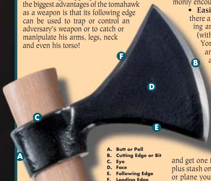
A. Butt or Poll B. Cutting Edge or Bit C. Eye D. Face E. Following Edge F. Leading Edge

• Cuts a Small Swath - Unlike a 12" kukri blade or 25" cutlass, the edge of the average tomahawk is quite short (seldom more than 4½" long) and thereby cuts a relatively small