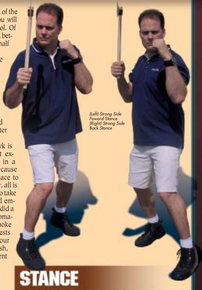
(Left) Strong Side Forward Stance (Right) Strong Side Back Stance

To assume this stance, take up a basic boxing position with your right hand forward (to you right-handed boxers, this is a southpaw stance). Grasp your tomahawk in a hammer grip near the bottom of the handle and extend it straight from the shoulder until your upper arm and lower arm form an L shape. Your gripping or strong hand should now be close to level with your right pectoral muscle, and your tomahawk blade will be about level with the top of your head. Make sure your weak shoulder is pulled back well to the rear. This will help in aligning your body so it presents a narrower target to the enemy. Also, remember to keep your left elbow in close and