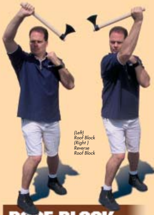
(Left) Roof Block (Right) Reverse Roof Block